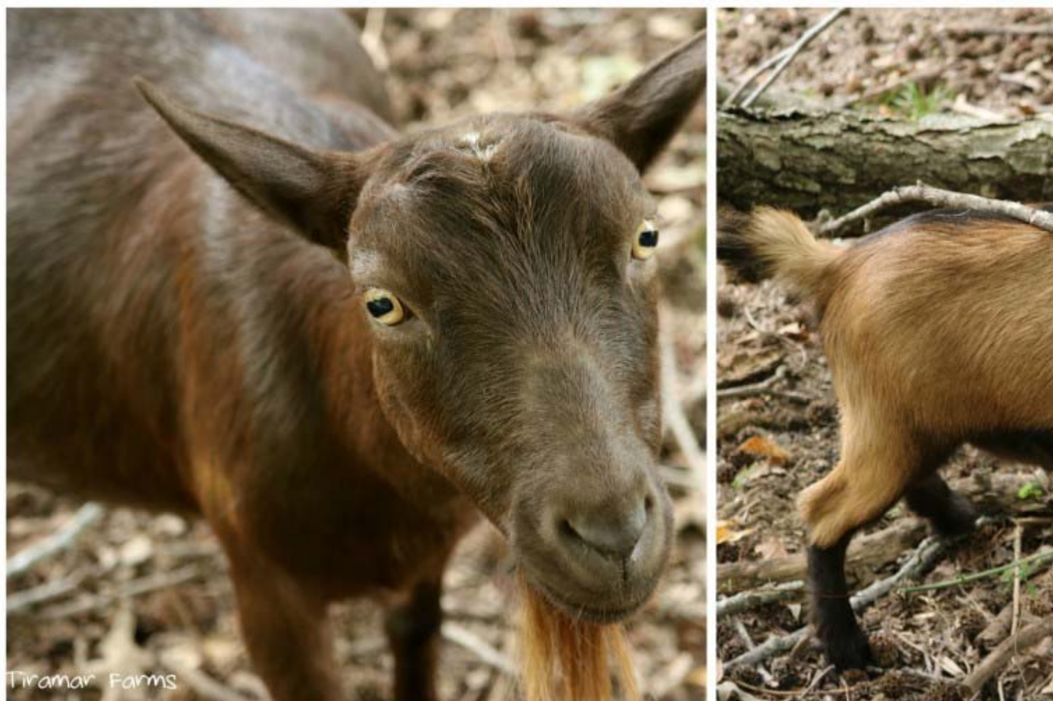
Mother and son with very different color patterns (solid chocolate [left] and chamoise [right])

This is where linebreeding and inbreeding become both useful and a bit risky, because they increase the possibility of hidden recessive genes being exposed. Those hidden genes can be beneficial or undesirable, and because they can be visibly hidden from the outside of the animal, we have no way of knowing if an animal carries the gene until it produces offspring with the trait.