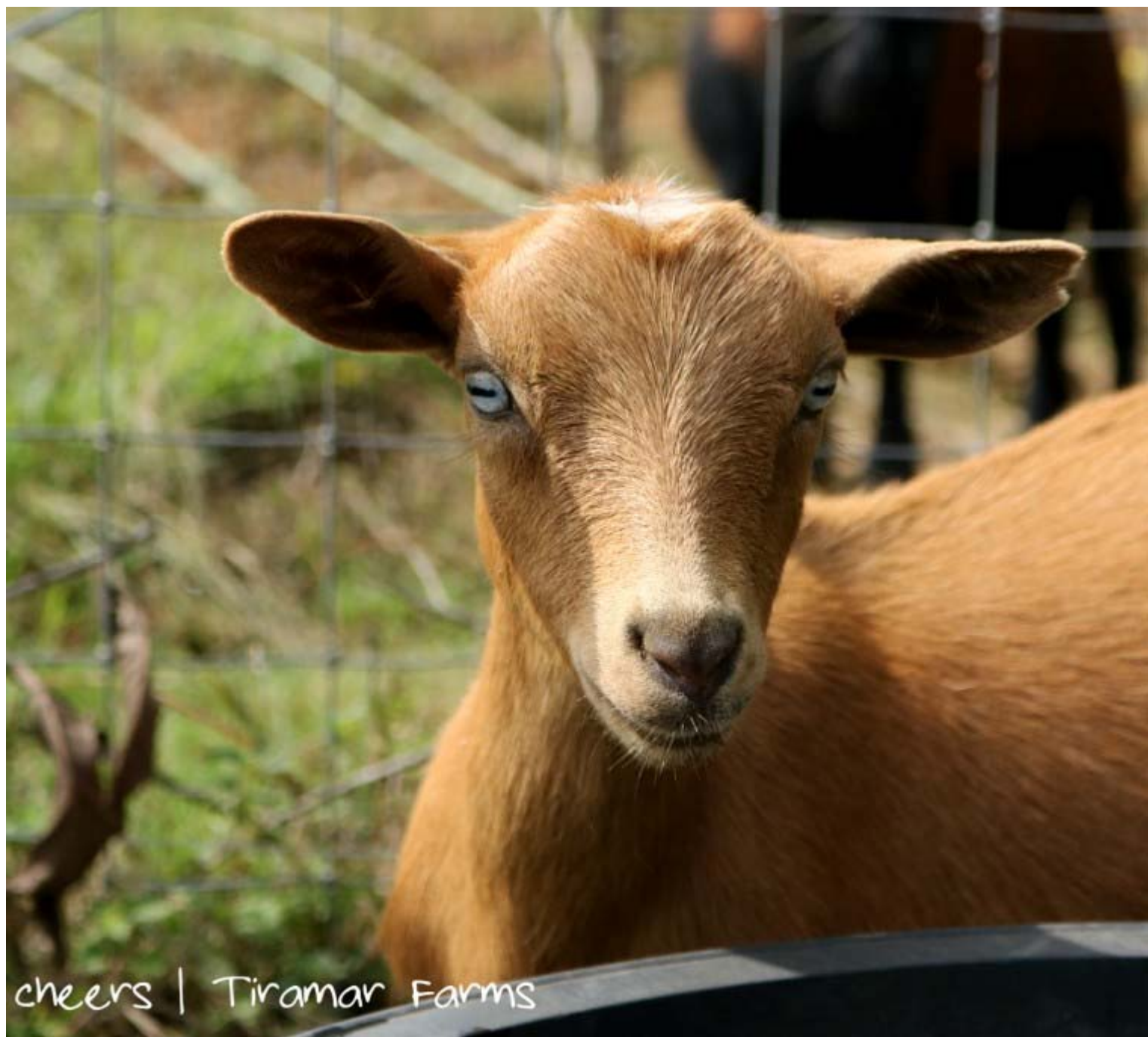
Miss Blue Eyes

Dominant genes require only one parent or one copy of the gene to be observable in the offspring. They are also always expressed in the animal when present. Blue eyes, polled, and moonspot genes are all dominant genes. If the gene is present in the animal, it is also expressed in the animal.